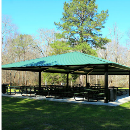
Baseball Field Pavilion

Swimming is only permitted when beach is open.